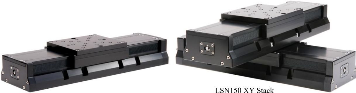
LSN150 XY Stack

Similar in construction to our LS family of stages, the LSN100 (100mm travel) and LSN150 (150mm travel) were developed to support a couple of our customers who were looking for drop-in replacement stages for previously designed tools. Features include a narrow profile (115mm wide), covered vertical side slots to prevent debris from entering the stage body, a two piece top plate for easy access to the drive screw for maintenance, and a 5mm ball screw drive capable of handling accelerations exceeding 1g (load dependant). Both horizontal and vertical straightness and flatness of travel are better than \pm 2.0\mu\text{m} per travel. Optical limit and home switches are included (5V or 24V). Both metric and NEMA motor flanges can be supported.